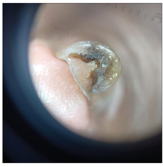
Figure 3: Onychoscopy image showing compact subungual hyperkeratosis with thickened and discoloured nail plate with wedge-shaped deformity.

Potassium hydroxide mount from nail and mucosal scrapings was negative for fungal disease. All routine investigations were within normal limits. Histopathological examination from the keratotic follicular papule revealed orthokeratotic