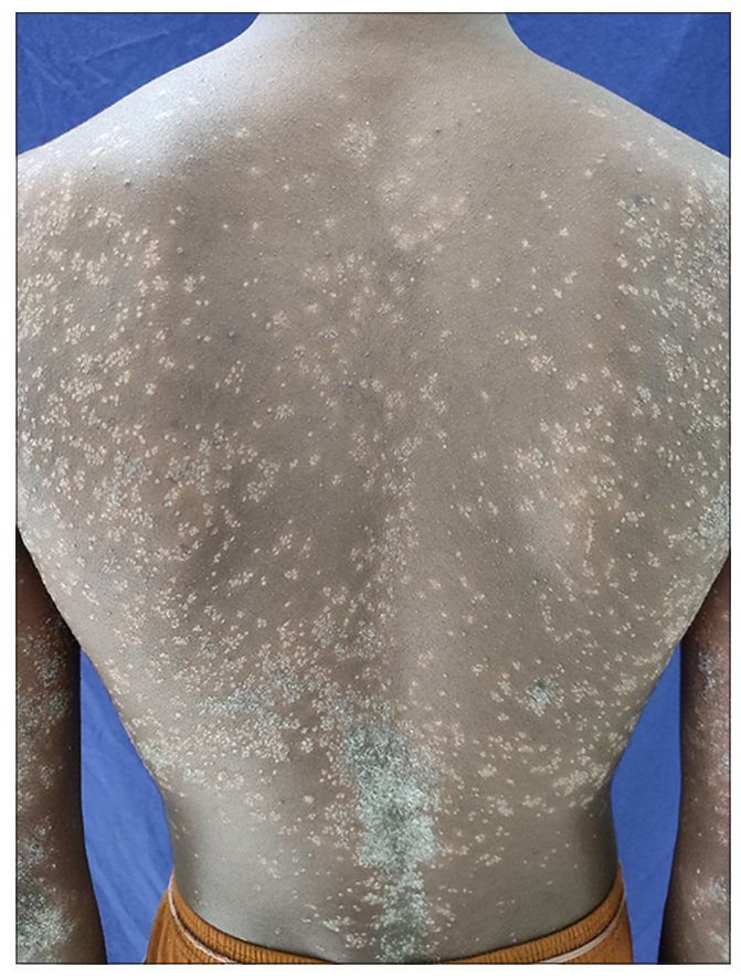
Figure 2: Multiple hyperkeratotic follicular papules involving trunk.

Potassium hydroxide mount from nail and mucosal scrapings was negative for fungal disease. All routine investigations were within normal limits. Histopathological examination from the keratotic follicular papule revealed orthokeratotic