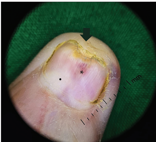
Figure 2: Onychoscopy showing distal onycholysis, marginal yellowish discoloration, nail-bed erythema (black arrow), splinter haemorrhages (*), and distorted lunula (.) in the first case.

Onychoscopy (DermLite DL4, 3Gen Inc, CA, USA) showed distorted lunula, distal onycholysis, splinter haemorrhages, nail pallor, microhemorrhages involving proximal nail fold [Figure 4], and longitudinal melanonychia (predominantly toenails). Nail-fold capillaroscopy showed microhemorrhages and avascular areas.