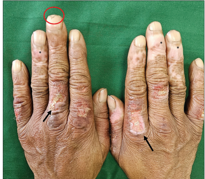
Figure 3: 57-year-old man who presented with chilblains, clinical image showing fingers with tender violaceous plaque, erosions with crusting (arrow), hypopigmented scarring over periungual and distal areas (*), distal onycholysis and nail pallor (circle).

Onychoscopy (DermLite DL4, 3Gen Inc, CA, USA) showed distorted lunula, distal onycholysis, splinter haemorrhages, nail pallor, microhemorrhages involving proximal nail fold [Figure 4], and longitudinal melanonychia (predominantly toenails). Nail-fold capillaroscopy showed microhemorrhages and avascular areas.