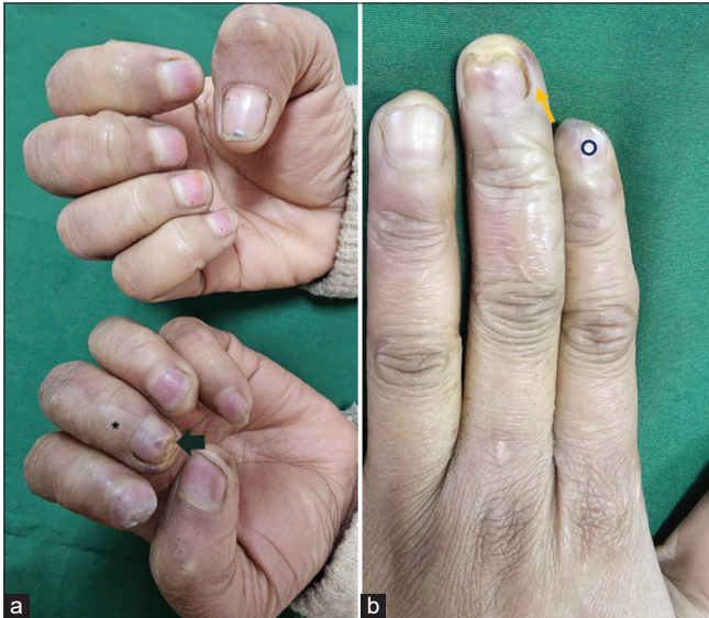
Figure 1: 33-year-old woman presenting with chilblains. (a) Clinical image showing clear fluid-filled bullae over dorsal aspect of fingers of the left hand, seen in contiguity with proximal nail-fold (*) erythronychia (black arrow). (b) Clinical image showing dystrophy of the nail plate (circle), distal subungual hyperkeratosis and erythronychia with splinter haemorrhages along with violaceous plaque over lateral nail fold (yellow arrow).