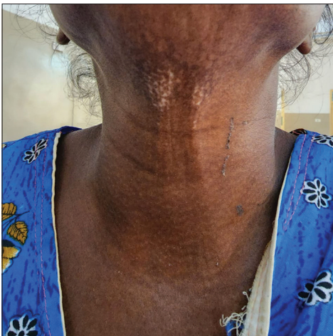
Figure 2: Salt and pepper pigmentation over the neck with Barnett's neck sign positive.