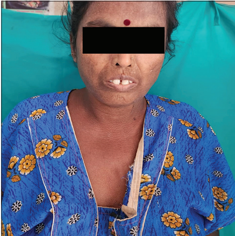
Figure 1: 40-year-old woman with scleroderma, presenting with fish mouth aperture.