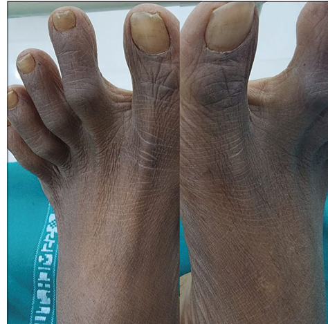
Figure 4: Nails of bilateral toes.