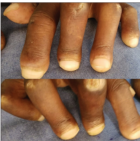
Figure 3: Acrosclerosis involving the fingers with racquet nails.

serology were normal. Anti-nuclear antibody titers were high. Chest X-ray revealed interstitial lung disease [Figure 6] and ultrasonography of the abdomen detected Grade 3 renal parenchymal disease. Skin biopsy and histopathological examination showed subcutaneous fat being replaced by fibrous connective tissue, densely packed collagen bundles and effacement of rete ridges. A diagnosis of scleroderma was made [Figure 7].