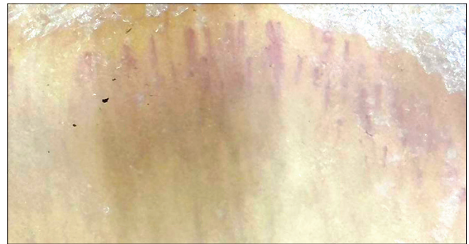
Figure 5: Nail fold capillaroscopy over the third digit nail fold (DermLite DL5) revealing early systemic sclerosis changes. (Polarised 10x).