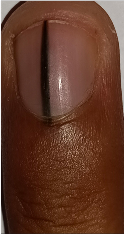
Figure 1: Clinical image of longitudinal melanonychia.

to the differentiated matrix cells through dendrites. [3] The pattern of nail pigmentation can be longitudinal presenting as a brown or black-grey band extending proximally from the nail matrix to the distal free edge of the nail plate; diffuse or total melanonychia with involvement of the entire nail plate by melanin; and transverse melanonychia involve transverse bands running across the width of the nail plate. [1,3,4]